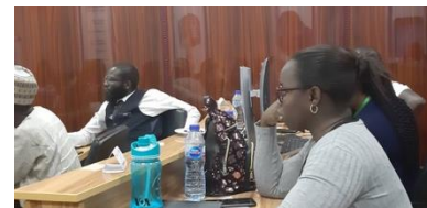
*A cross section of participants at the Abuja Building Digital Capacity workshop.

Training Outline covered: Characterization & Elements of Social Media (Chioma), Writing for Social Media: Things to Note (Chioma), Fact-checking Social Media Content (Chioma + Sani Mohammed), Distributing Content on Social Media - Facebook (Chioma), Building a personal brand via social media (Chioma), Distributing Content on Social Media - YouTube, WhatsApp & Instagram (Chioma), Gender-Sensitive Reporting via Social Media (Chioma), Media Ethics and the VOA Firewall (Sani Mohammed), Building a Competitive Edge (Sani Mohammed), Media Branding (Muhammad Abba).